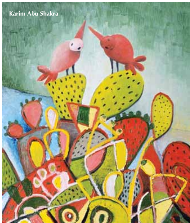
Karim Abu Shakra

In Agbaria’s works there is an attempt to retrieve visual memories that are tied to the land; vague childhood scenes painted in a yellow ochre color reflecting light and hope, trying to reclaim the light of childhood from mountains and fields in the countryside. There is a visible attempt to extract the climax of the moment, live it and dream it.